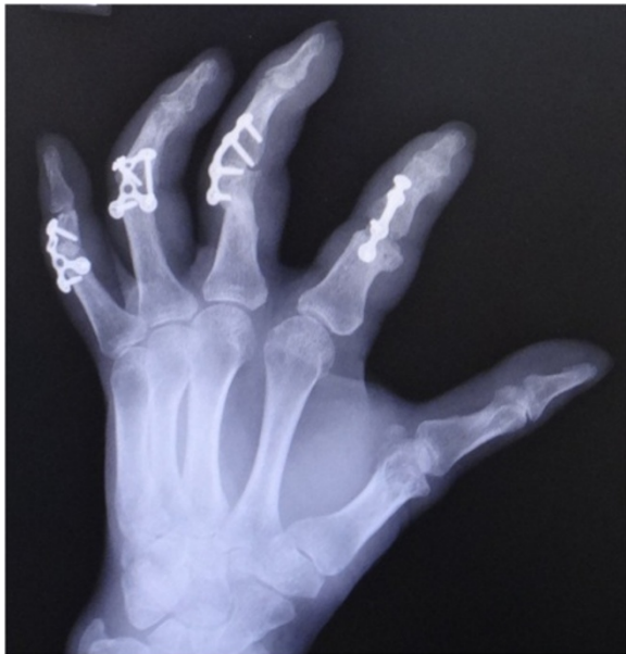
Fig. 5 An X-ray image after arthrodesis with micro-plates at an angle of 45° of the PIP joints