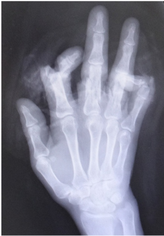
Fig. 12 Case 3. An X-ray image of injured hand