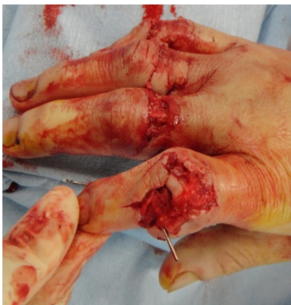
Fig. 13 Intra-operative photograph shows exposure of PIP joint

20 out of 23 patients in the replantation group always used the replanted finger for activities of daily living, whereas only 9 out of 23 patients in the amputation closure group always used the affected fingers. The replantation group also had less pain and a better DASH score. They concluded that replantation not only facilitated more favorable esthetics, but also a better functional outcome [9].