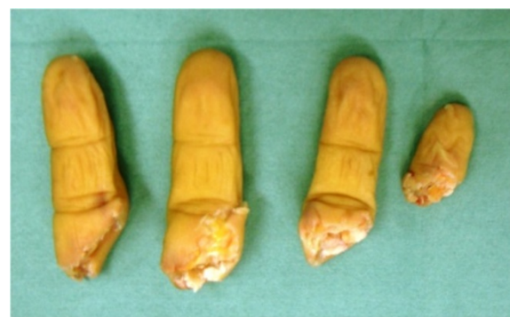
Fig. 1 Case 1. A 53-year-old man sustained complete amputation to the left index, middle, ring and little fingers. View of amputated fingers

A 44-year-old man suffered from complete amputations at the level of the middle phalangeal bone of the right index finger along with the crush fracture on the PIP due to being caught in the food cutter (Fig. 8). The patient underwent replantation and arthrodesis at an angle of 45° of the PIP joint (Fig. 9). Good form and acceptable function in opposition and grasp were evident 13 months after the procedure, while the active TAM was 90° and the DASH score was 11 points (Fig. 10).