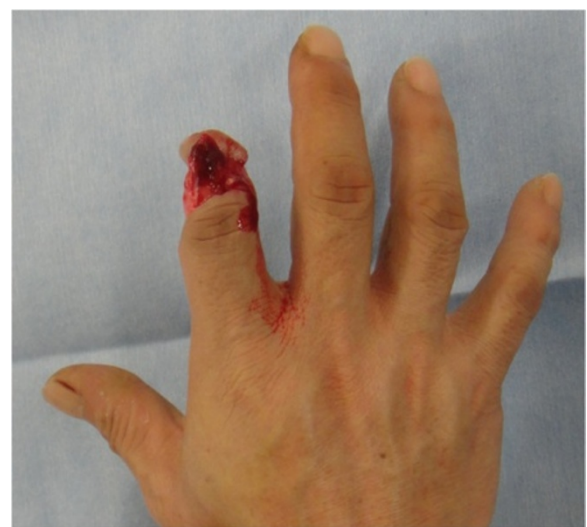
Fig. 8 Case 2. A 44-year-old man suffered from complete amputation at the level of the middle phalangeal bone of the right index finger along with crush fracture on the PIP joint