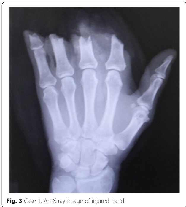
Fig. 3 Case 1. An X-ray image of injured hand

A 57-year-old woman suffered from incomplete amputations at the level of the PIP joint of the right index finger without distal circulation, along with crush fracture on the proximal phalangeal bone of middle, ring and little fingers due to being caught in the rotor of a food