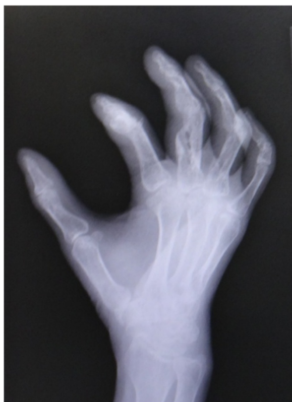
Fig. 15 An X-ray image 15 months after surgery shows bone union of PIP joint of index finger

This manuscript has not previously been presented at any meeting. This article is original and has not previously been published.