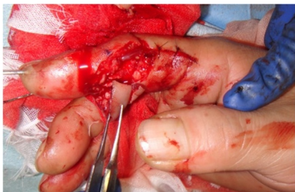
Fig. 9 Intra-operative photograph shows vascular anastomosis and PIP fixation with K-wire

and a cosmetically pleasing outcome compared with conventional stamp plasty [6]. However, it is still difficult to achieve satisfactory functional results in cases of replantation or revascularization at the level of the PIP joint. Avulsion amputations at the PIP joint are likely to result in permanent disability of the hand [7]. Thus, many investigators considered that replantation of a single finger amputated proximal to the flexor digitorum superficialis insertion was seldom indicated [1]. Soucacos et al.