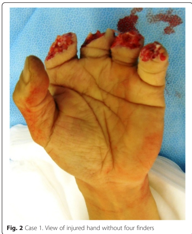
Fig. 2 Case 1. View of injured hand without four fingers