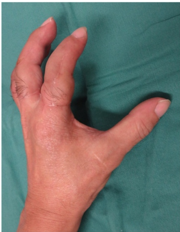
Fig. 6 View of injured hand 3 months after the secondary surgery. The PIP joints were fixed at an angle of 45 degrees