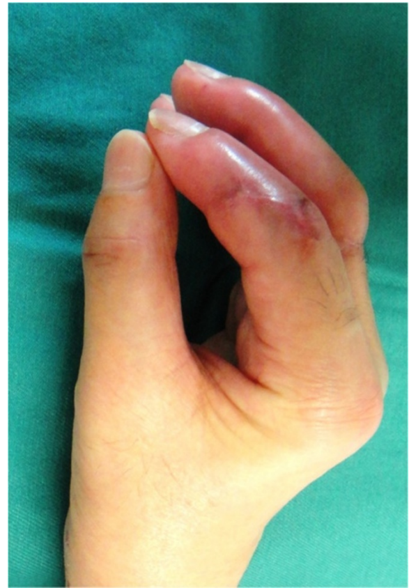
Fig. 14 The picture 15 months after surgery shows good form and acceptable function in opposition