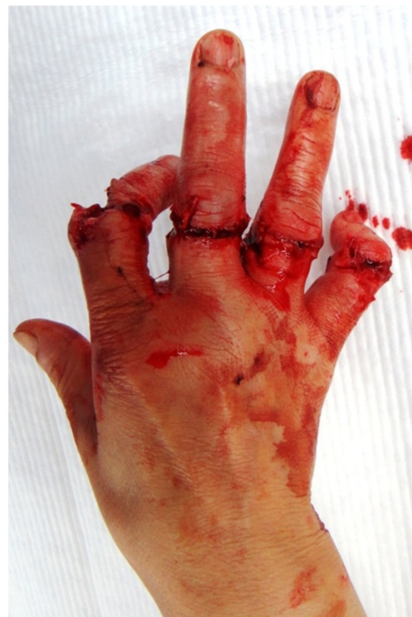
Fig. 11 Case 3: A 57-year-old woman suffered from incomplete amputation at the level of the PIP joint of the right index finger without distal circulation, along with the crush fracture on the proximal phalangeal bone of middle, ring and little fingers

evaluated the functional outcome of 67 successfully replanted single-digit amputations, and concluded that the indications for replantation of a single-digit amputation should be as follows: 1) amputation distal to the insertion of the flexor digitorum superficialis; 2) ring injuries type II and IIIa; and 3) amputations at the level of or distal to the DIP joint [8]. Davis and Chung recommended revision amputation with skeletal injury at or proximal to the PIP joint in patients who are unwilling to accept a poor functional result [6].