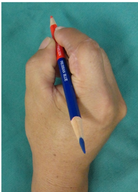
Fig. 10 The picture shows good form and acceptable function in opposition 13 months after replantation

and a cosmetically pleasing outcome compared with conventional stamp plasty [6]. However, it is still difficult to achieve satisfactory functional results in cases of replantation or revascularization at the level of the PIP joint. Avulsion amputations at the PIP joint are likely to result in permanent disability of the hand [7]. Thus, many investigators considered that replantation of a single finger amputated proximal to the flexor digitorum superficialis insertion was seldom indicated [1]. Soucacos et al.