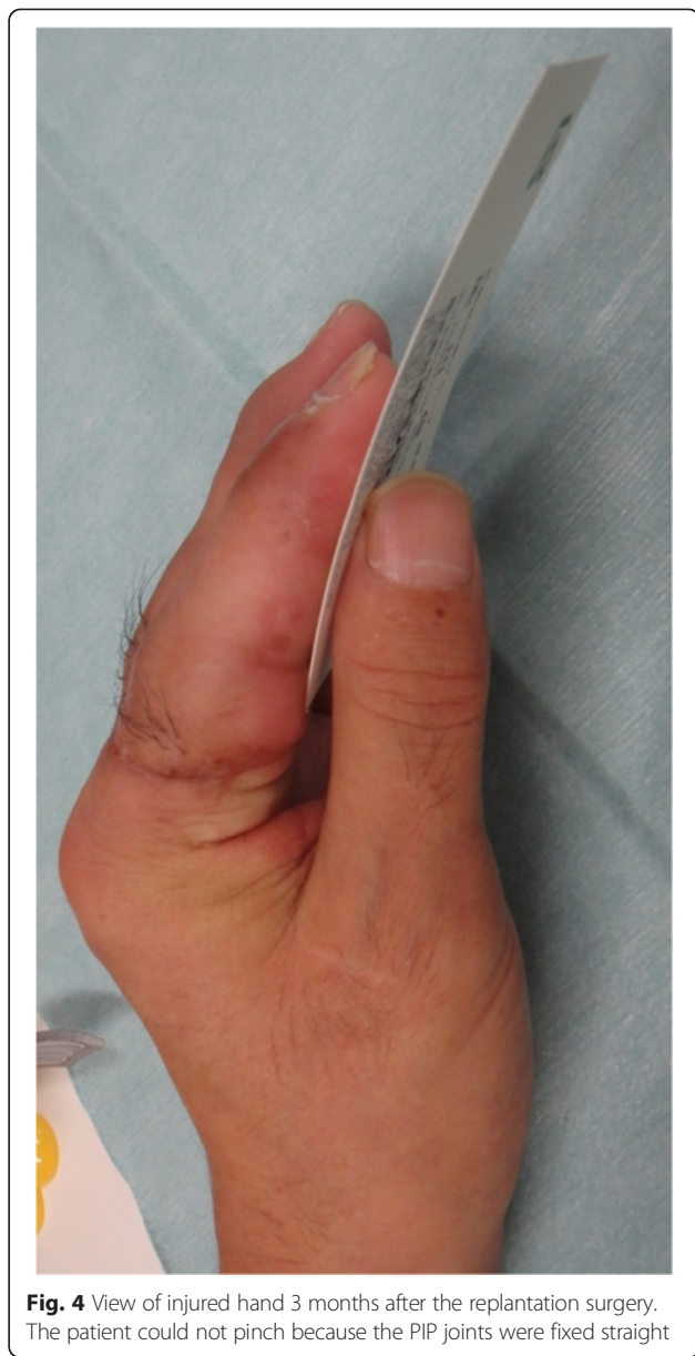
Fig. 4 View of injured hand 3 months after the replantation surgery. The patient could not pinch because the PIP joints were fixed straight

processor (Fig. 11, 12). The patient underwent revascularization and PIP joint arthrodesis at an angle of 45° of the index finger, and reduction and K-wire fixation of the other three fractured fingers (Fig. 13). Good form and acceptable function in opposition and grasp were evident 15 months later, while the TAM was 80° and the DASH score was 15 points (Fig. 14, 15).